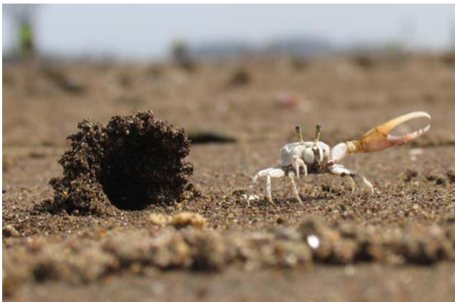
Figure 1. A male fiddler crab Uca terpsichores with a sand hood as a sexual signal. The male waves its enlarged claw to attract females to its burrow which has a sand hood at the entrance. Males are about 1 cm wide. Hoods project above the visual horizon of crabs. This makes them conspicuous landmarks that help crabs find burrows. doi:10.1371/journal.pone.0000422.g001