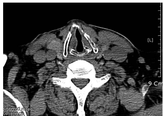
Figure 2. A computed tomography (CT) scan of the patient's neck showed symmetric bilateral vocal fold.

Arytenoid cartilage dislocation is a rare complication with a reported incidence of 0.023% to 0.097%. [1,2] The most common etiology is intubation trauma by direct laryngoscopy (77.8%), followed by external neck trauma (17.4%). [3] Predisposing factors include diabetes mellitus, chronic renal failure, chronic corticosteroid use, laryngomalacia, and acromegaly, which can weaken the cricoarytenoid joint, and diseases involving the cricoarytenoid joint itself, such as cricoarytenoid arthritis or degenerative changes. [4,5] Our patient had no history of any of these predisposing factors. Among the reported cases of intubating injuries, left-sided dislocations account for 55%, right-sided dislocations for 39%, and bilateral dislocations for 4%. [3] The left arytenoid is thought to be more vulnerable to subluxation because the laryngoscope is typically held in the left